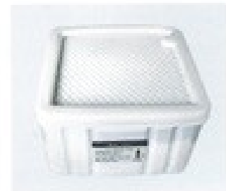
Main Filter (Replacement: 3-6 months)